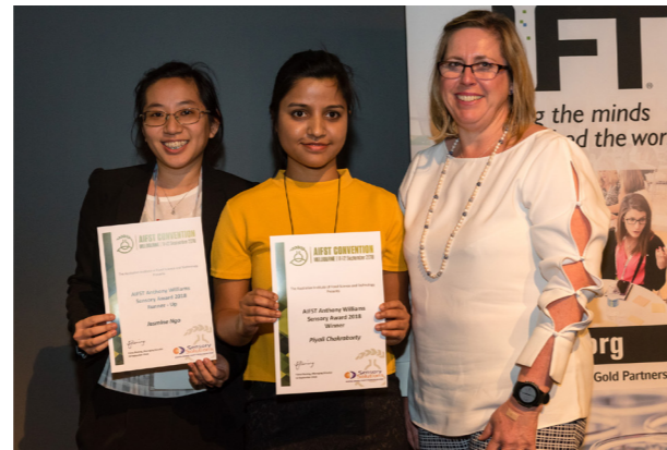
AIFST Anthony (Tony) Williams Sensory Award