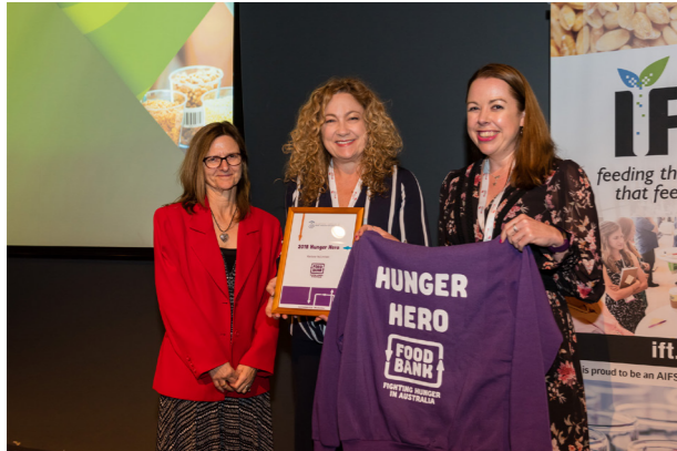
AIFST Foodbank Hunger Hero Award