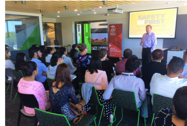
WA Summer School