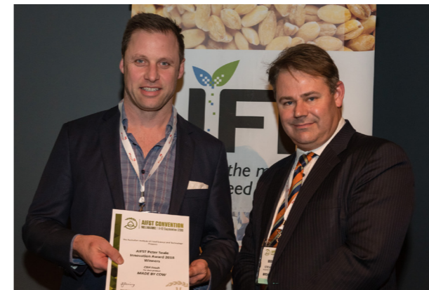
AIFST Peter Seale Food Industry Innovation Award