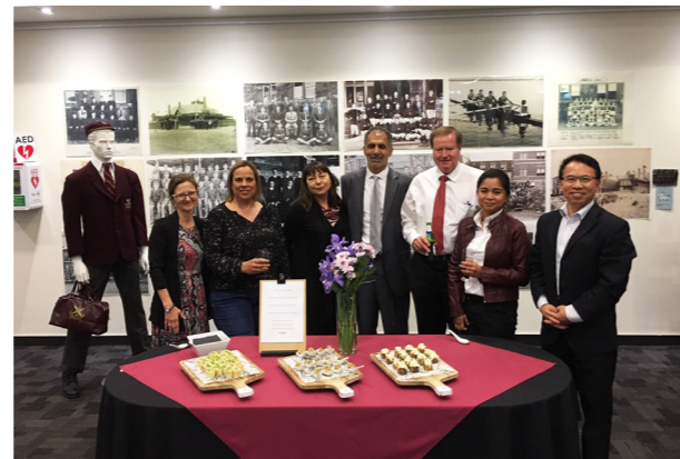
Town Hall - Perth