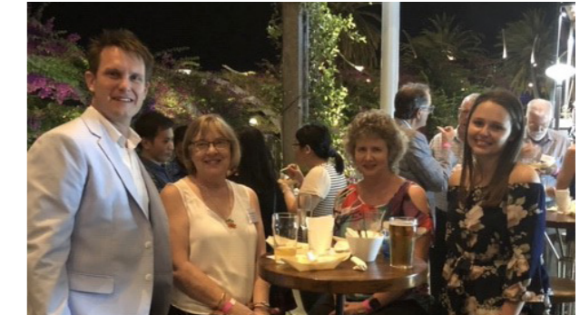
Christmas Party - Brisbane