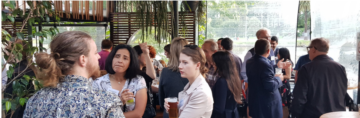
Christmas Party - Melbourne

On behalf of the Board, staff and members, I would like to acknowledge the contribution of our Community of Interest Committees as volunteers of the Institute. We recognise your contribution is above and beyond your daily professional demands and should not go unrecognised. Our volunteers ongoing input and guidance is crucial to ensuring we are delivering value to our members.