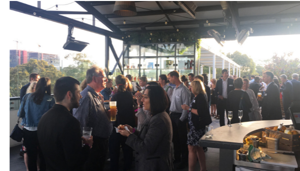
Christmas Party - Sydney