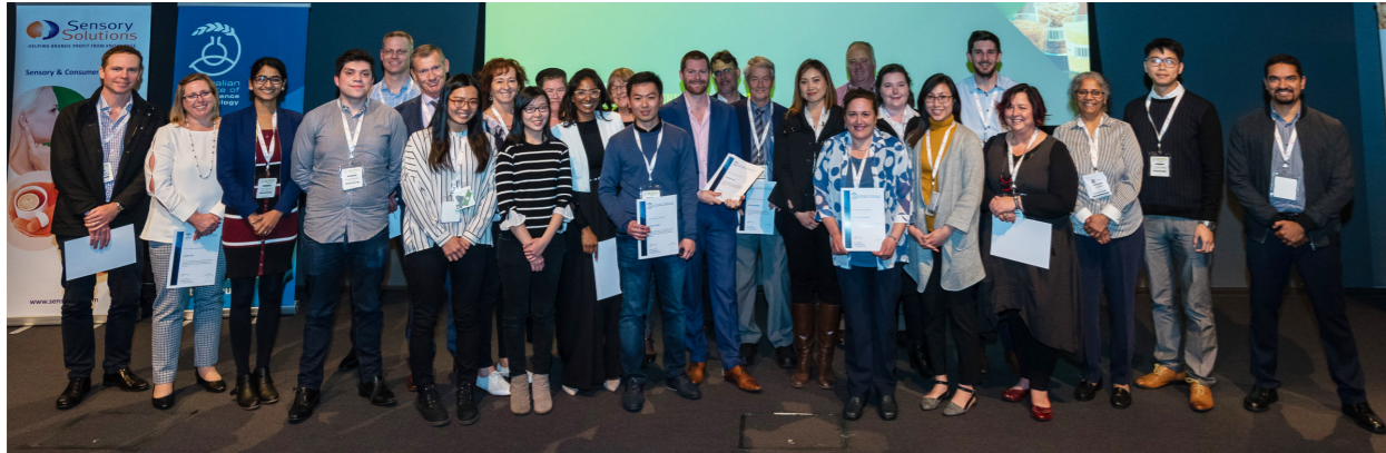
2018 AIFST Mentoring Program Graduation