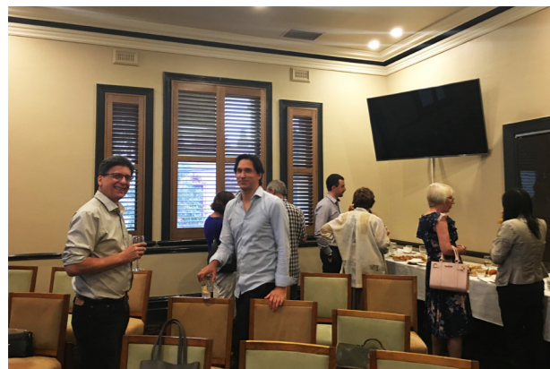
Town Hall - Melbourne