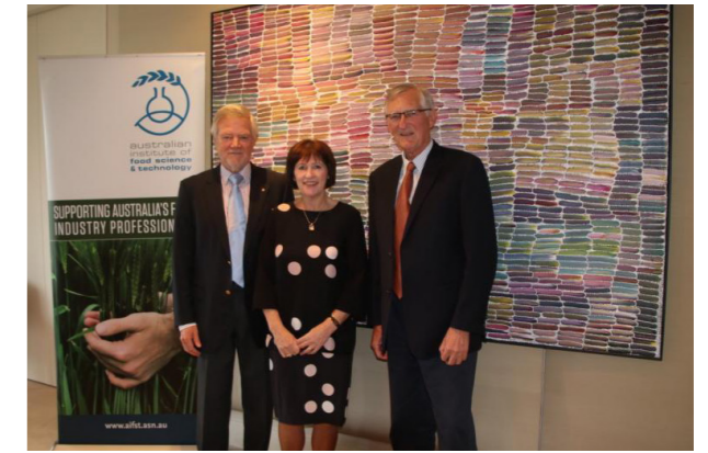
AIFST President's Award

In 2018 the award went to CBH Fresh, Made by Cow.