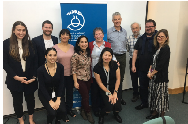
Town Hall - Sydney