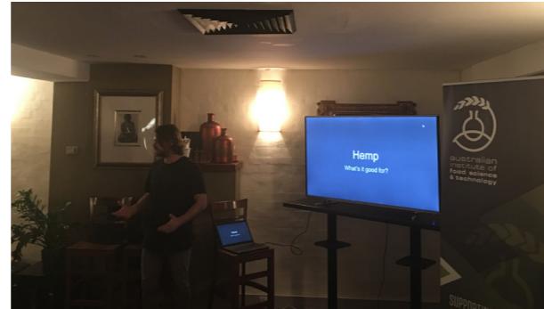
Food Science Social – Sydney