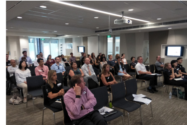
Listeria Workshop – WA

In 2018 webinars were a popular and convenient learning option with a range of topics and presenters. All the webinars were recorded and available to members free of charge on the AIFST website.