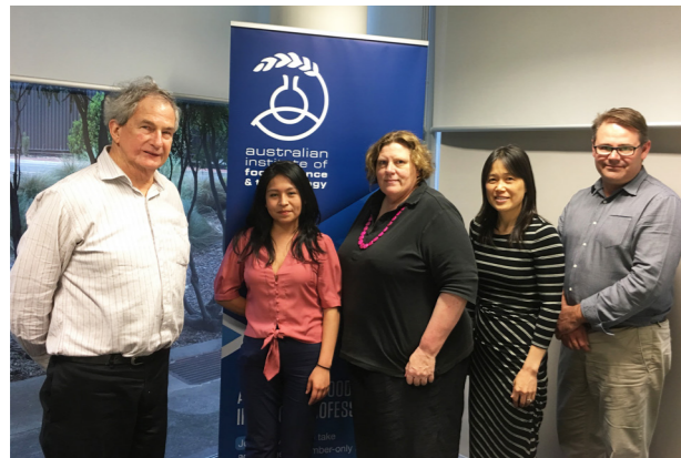
Town Hall - Adelaide