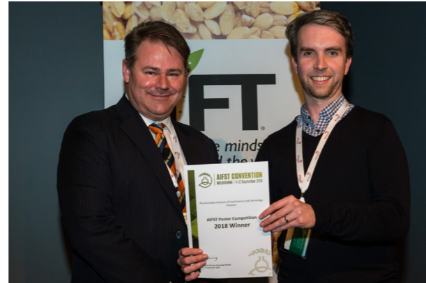
Research Poster competition winner