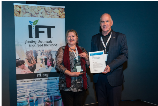
AIFST Allergen Bureau Julie Newlands Award