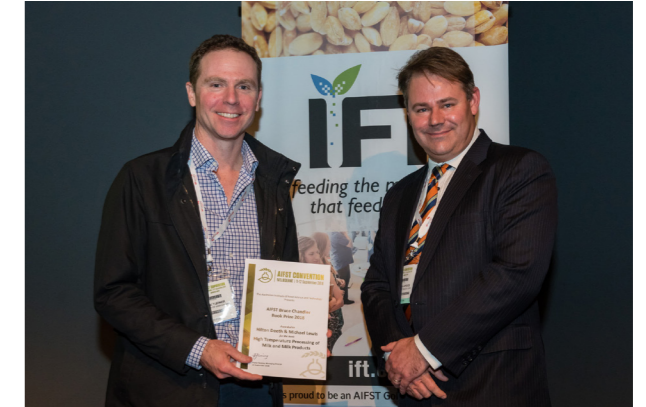
AIFST Bruce Chandler Book Prize

The AIFST Peter Seale Food Industry Innovation Award recognises a company or organisation for a significant new development in a process, product, ingredient, equipment or package that has achieved successful commercial application in the Australian food industry.