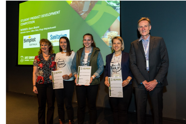
Student Product Development Competition