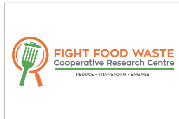
Fight Food Waste CRC