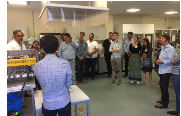
WA Summer School

Summer School was hosted at Curtin University in Perth, WA in February 2018. The total number of participants was 26. This was a great few days with a diverse program and a stronger focus on industry engagement than previous years, where the focus was more on student presentations.