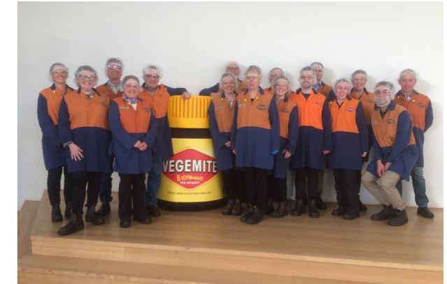
Factory Tour – Melbourne