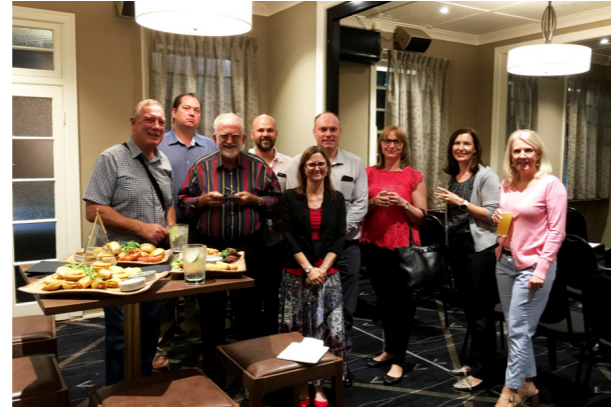
Town Hall - Brisbane